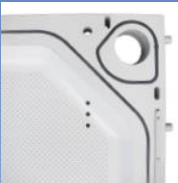
Gasket Membrane Center Web