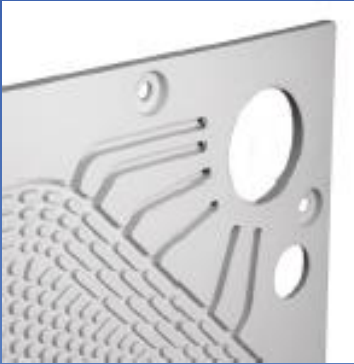
Corner Bore Hole