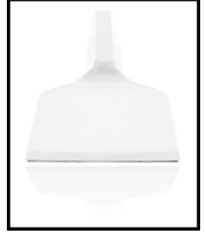
Low-density material extra soft and flexible