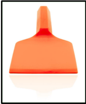
High-density material hard and stiff, hot water resistant