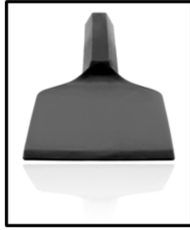
Material with electrical conductivity