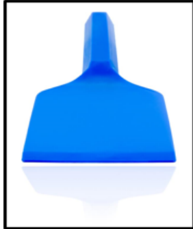
Medium density material semi-hard and somewhat flexible